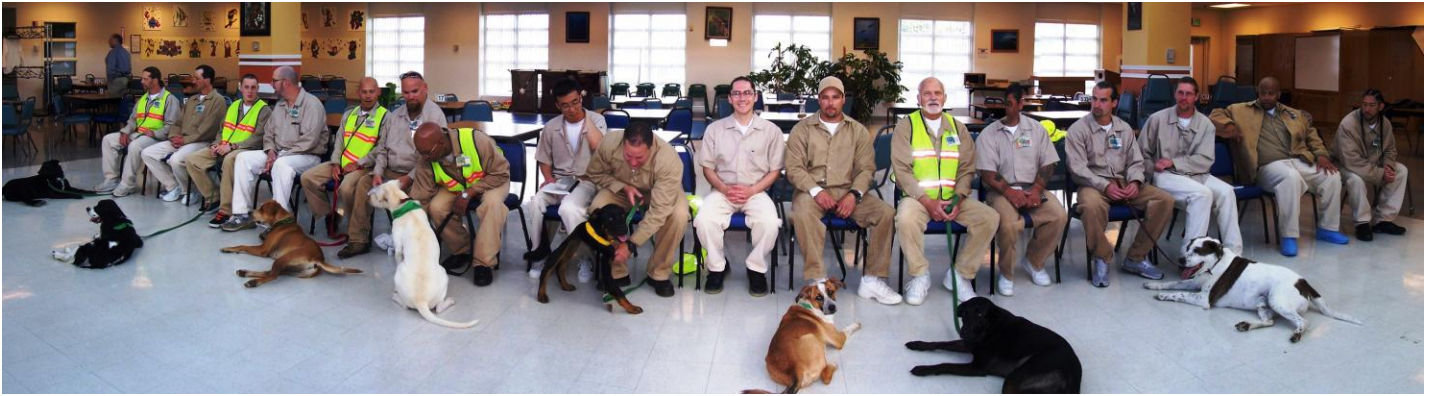
Trainers and dogs prior to graduation.....

A new batch of dogs is here! Watch for the upcoming newsletter with pictures and information!!!