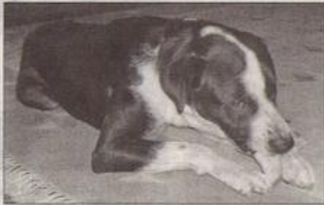
A fully recovered Buddy contentedly chews on a bone in his current foster home.

Buddy was skinny and undernourished. His foster family started making the rounds of local vet clinics to