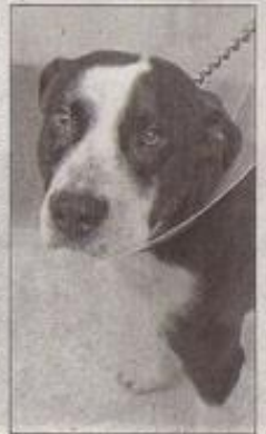
Buddy ready for release from the hospital following his surgery.

HAVA is asking for donations to refill the Friskie Fund,